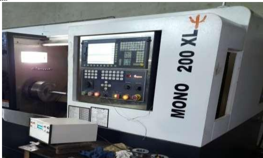
Figure 1: CNC Lathe

in order to use the widest possible ranges of values. Also, the possibility of mechanical system and manufacturer's recommendation were taken into account.