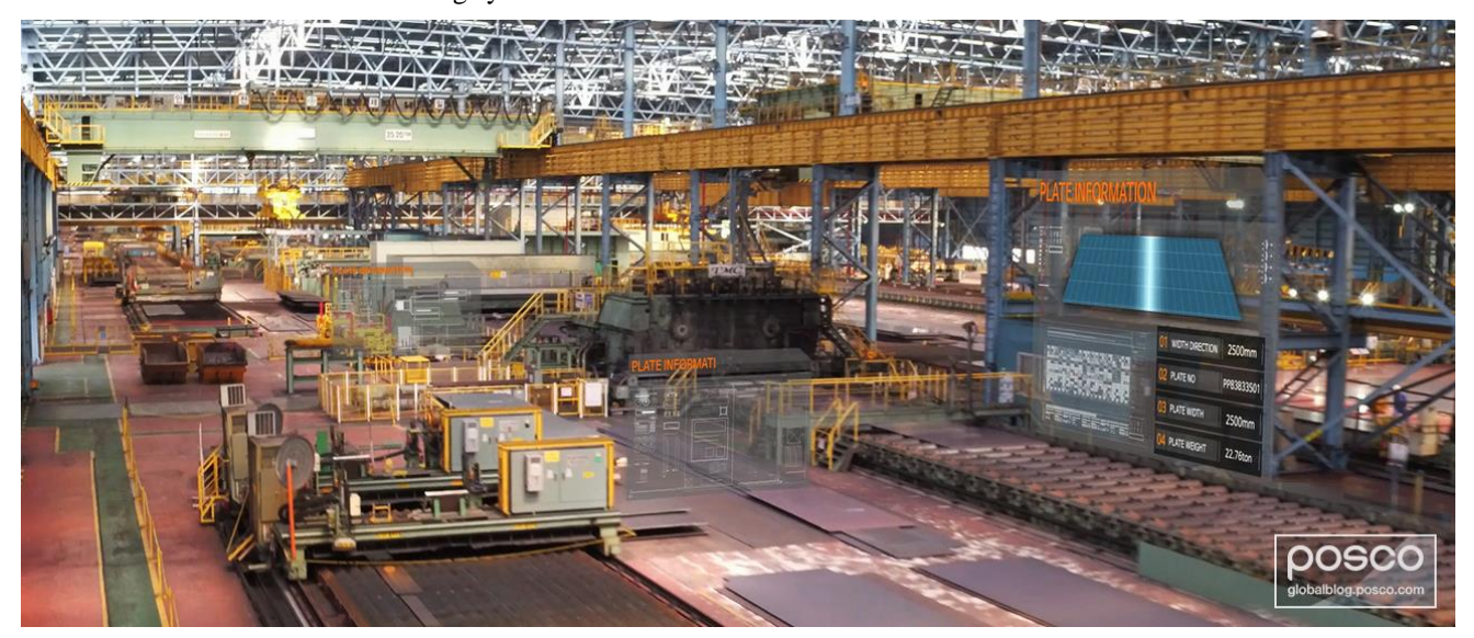
Figure 2: The Gwangyang POSCO Smart factory

Simulation of manufacturing assembly lines: Methods for the modeling and optimization of processes have been developed in the steel industry. The development of decision support systems has as its primary objective the exploration of potential alterations to the design and functioning of the system. In addition to that, innovative numerical methodologies have been applied, such as meshless methods in the modeling systems for the steel sector.