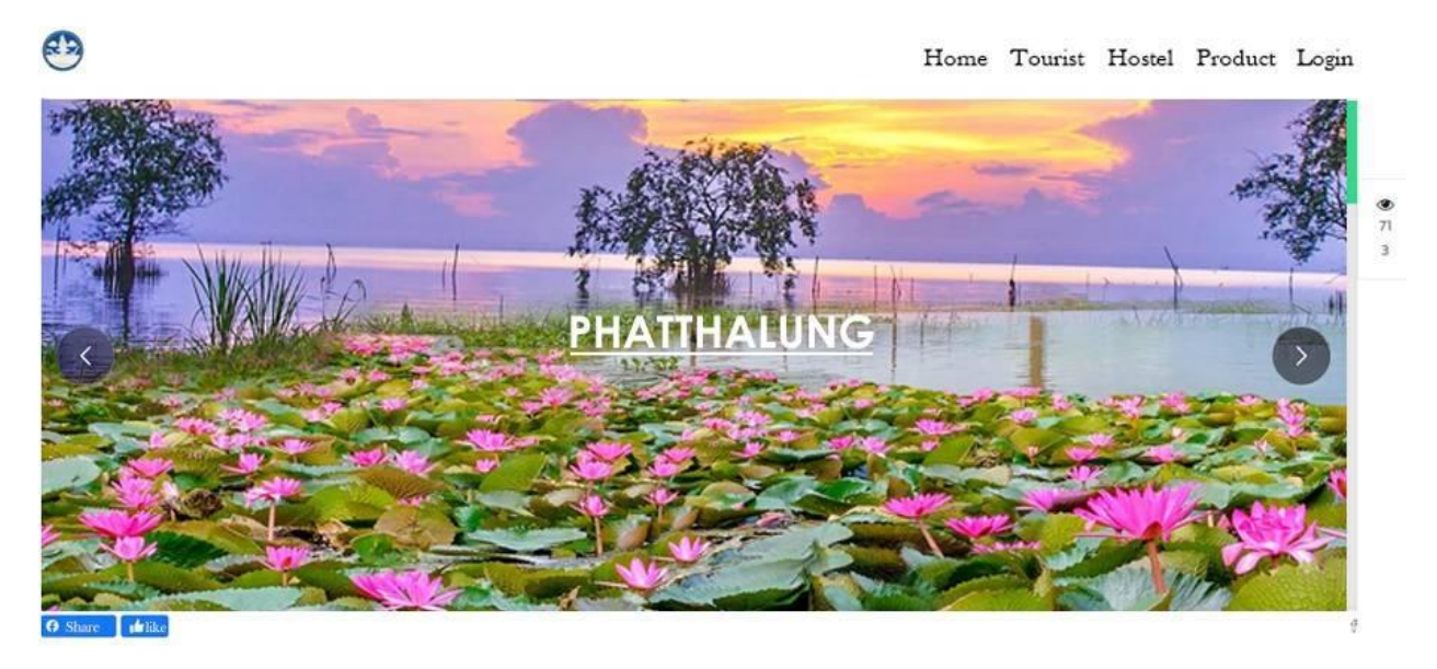
Figure 1 Home Screen of Community Enterprise Digital Data Storage System

For community-based tourism supply chain in Phatthalung Province, services and products delivered to tourists were divided into 6groups (Intujanyong et al, (2014: (1Accommodation, (2Travel Agents, (3Tourism Publicity Agencies, (4Tourism Business and Activities, (5Business and food services, and (6Travel Business. All groups were consistent with and affected the development of a digital data storage prototype for community enterprises that served to deliver products and services to tourists. Therefore, the developed community enterprise digital data storage system consisted of two parts: a storefront system for tourists who visit websites in Thai language, as shown in Figure 1. The customers could buy community enterprise products and find details on addresses, travels, and points of interest within Phatthalung Province, as shown in Figure 2. Database software system was provided for product or service owners to be able to record in order to present historical information, product sources, and product information in the form of digital media, such as images, audio, clips, videos. The system afforded the linkage to the social media of each community enterprise in asking for more details from manufacturers of community enterprises, as shown in Figure 3.