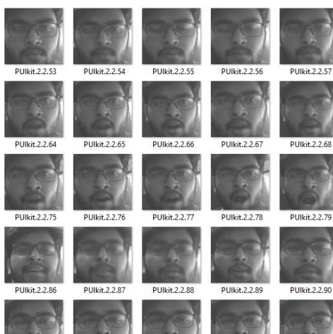
Figure 2. Images stored in the database.

These phase is starting phase of recognition it basically start on the real time image processing capture the images of the registration person through the Droid cam, this is the initial phase of the system after 100 second the system take the images and try to trained the images into the specific folder where the take up to maximum 50 images of the person, all the trained images stored in the file according to which the person can be recognized as shown in figure 2.