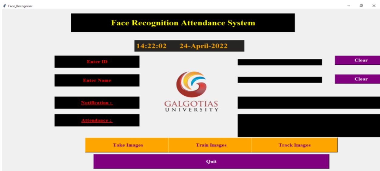
Figure shows Interface of the system, Algorithms being used:

be on and student have to sit in front of the camera and give some images with different face angles .after registering the all students in that software then the image will be compared from the database image and if the matching is found then the attendance will be recorded. In left there is an excel sheet will be generated in which the time and date is also mentioned in that and which students are present in the class and the student which are absent all were mentioned there. Generally this process will be divided into the four steps, 1. Training a data set in this photos are taken from the web cam with different face angles . 2. Then student have to just enter the roll number and name of that student and show some images of that students and it verifies that whether that student is recognized or not if they recognized then they automatically mark the attendance. And it will occurs with the help of the haarcascade algorithmhaarcascade_frontalface_defaultfile.haarfeatures it is use for the feature extraction in this open cv provides the detect multi scale.so in this it just creates a rectangular shape in the position of the face . it provides three parameter like scalefactor,min neighbour and one more is min size.is showing how much an image can be reduced . The minneighbourst shows the quality of the faces..minSizeis used to that how small thing u want to detect like if we are showing our image from very far place so this minsize factor will help us.