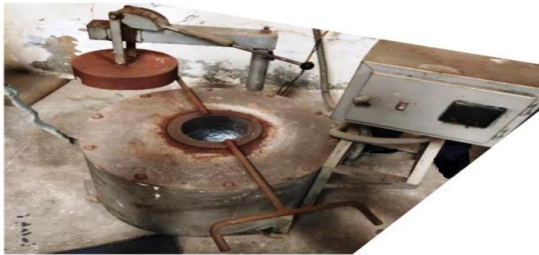
Fig- Stir Casting Machine Setup

Methods Used:- Stir Casting, Die casting, Powder Metallurgy, Ball roll mill processing etc.