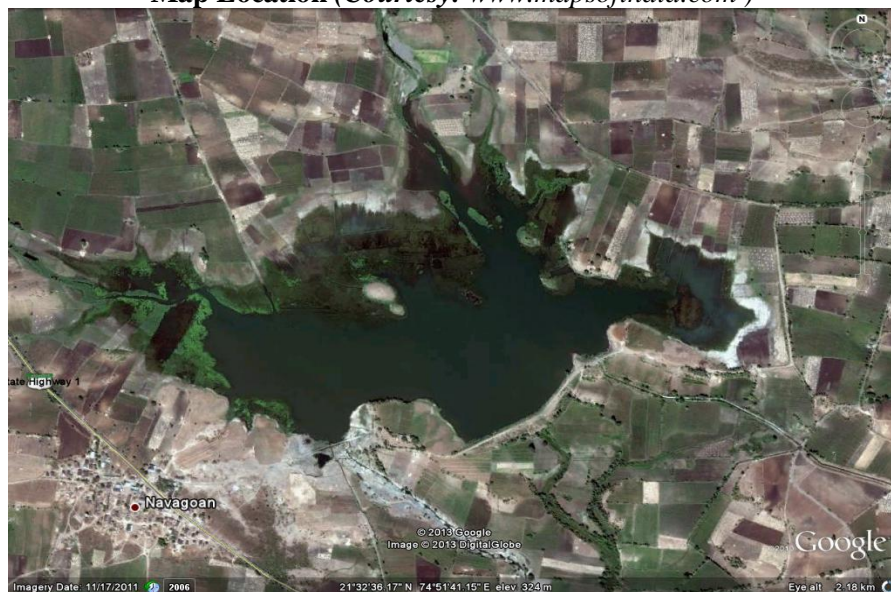
Google Satellite image of Budki Medium Irrigation Tank (21°32'36N 74°51'41E)