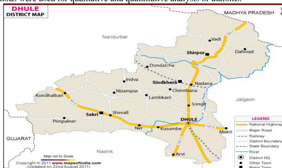
Map Location

The study site was visited at an interval of a month from January, 2009 to December, 2010. Surface water samples were collected from three stations of Budki M.I.tank (BMIT) namely BMIT-A, BMIT-B and BMIT-C between 8 a.m. to 10 a.m. For each parameter studied the average of these stations were taken. Standard methods were used for qualitative and quantitative analysis of diatoms.