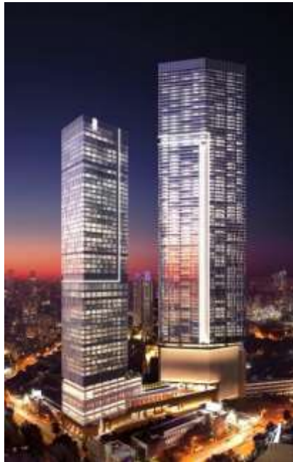
FIGURE 3: TWIN TOWER OF THREE SIXTY WEST AT MUMBAI.