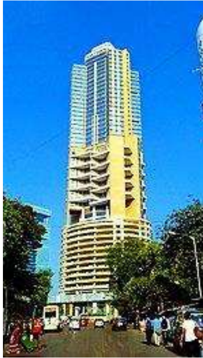
FIGURE 2 INDIABULLS SKY TOWER AT MUMBAI

Seven day slab cycle was the target to achieve, for this the main technologies adopted at construction was ACS system, guided climbing system for RCC walls, lightweight panel formwork used for columns and walls, generic panel slab formwork, high performance pumps, tower cranes, high speed hoist of sufficient capacity, advanced concrete mix and concrete booms. Due to space constraints, erection of tower cranes and other equipment was difficult. Thus a plan for bringing equipment on site and erecting them was done considering the traffic and dense area. The major equipment was selected and placed at a desired location to ensure ease of access and delivery. The vertical transportation system requires maintenance, proper analysis and modification constantly during the building construction. Seven self-climbing concrete booms which can be placed in the core lift shaft or on the slab. Vertical transportation of concrete before its initial setting time is a crucial task. This can only be possible by advanced equipment having a greater capacity of work done per unit time. The stakeholders play an important role in providing sufficient funds, expertise in construction management, introduction of new technology, consultation and proper design.