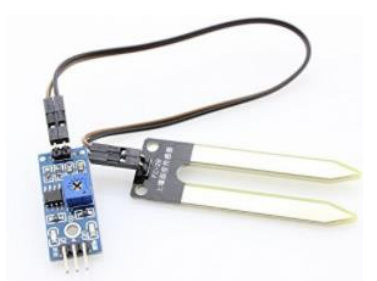
Fig 4. Soil Moisture Sensor