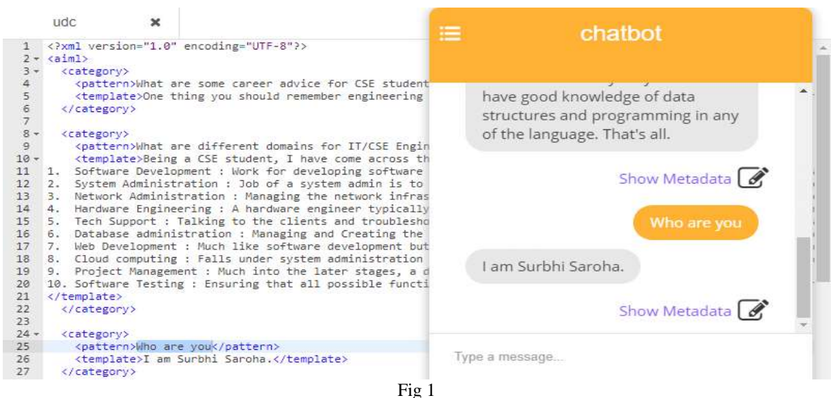
User Interface Sample