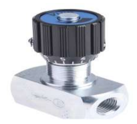
Fig.4 Flow control valve for Refrigeration control