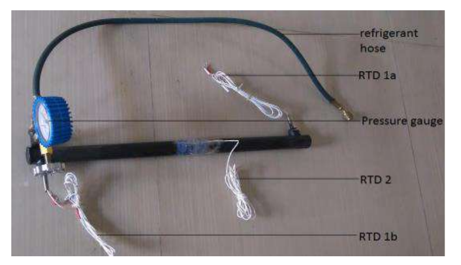
Fig. 3 Refrigerant tank

The refrigerant tank fitted with pressure gauge and RTD's is illustrated in Fig.2 and the flow control valve is illustrated in Fig.4.