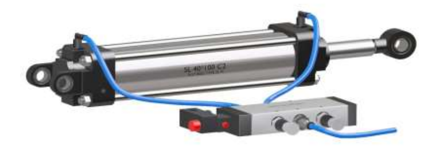
Fig. 2 Pneumatic actuator cylinder

The pneumatic actuators are cost effective equipments since they are light in weight and require very less maintenance with continuous operations. Fig. 2 illustrates the pneumatic actuator utilized in this research workA single-piston pneumatic cylinder or actuator has only one port through which air enters and moves the piston in only one direction. The piston is then returned to its original position by a spring. These pneumatic cylinders are suited for slower operations due to their short stroke length. They also use less air, resulting in higher efficiency and lower operating costs.