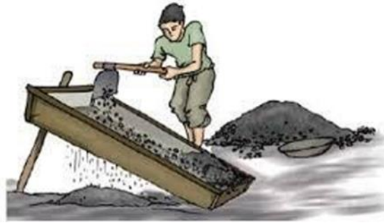
Fig 1: Conventional Method of Screening

Hand-operated Rotary sieve [4] is very good modified method in compare to old traditional ways of sieving sand. It rotates using handles, making the sieving process more effective. It is primarily utilized in tiny manufacturing processes, such as labs. It has now been further modified by addition of electrical motor to reduce the manpower and increasing the efficiency, this modification is known as machine-operated sieve.[5]Because of this automation in machine it is so crucial on construction sites, it has been modified further again and again, so it is now recognized practically everywhere.