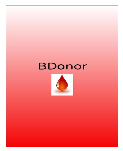
Figure 4. Welcome Page

In Login Page (figure 5), user can regsitered themsleves by clicking on "New Here? Register?" and then register page will open as shown in figure 6.