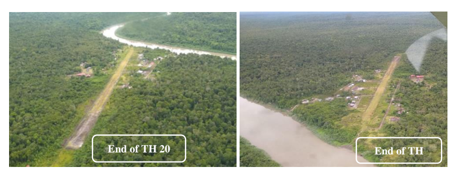
Figure 3. Location of Airstrip Pagai – Airu District