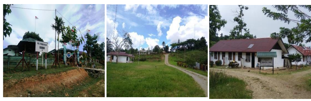
Figure 6. Road Conditions to Airstrip Ubrub Location

Airstrip Ubrub is located in the village of Umuaf. Accessibility to Kampung Umuaf can be reached by road by double gardan (4 WD) from Sentani taken for \pm 8 hours. The condition of the road to Airstrip Ubrub is still not good there are many potholes and some bridges to Airstrip Ubrub are still wooden bridges. Here is a documentation of public facilities, road conditions, and bridges leading to the Web and Airstrip Ubrub districts.