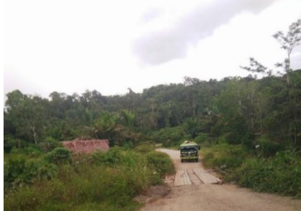
Figure 4. Road Conditions to Airstrip Waris Location

The population of Waris District is 3,425 people. Most of the population is men, which is 52.18 percent, while the female population amounted to 47.82 percent of the entire population in Waris District. With an area of \pm 911.94 km2 means that the population density only reaches 3.88 people per km2. This means that every 1 km is only inhabited by 4 people.