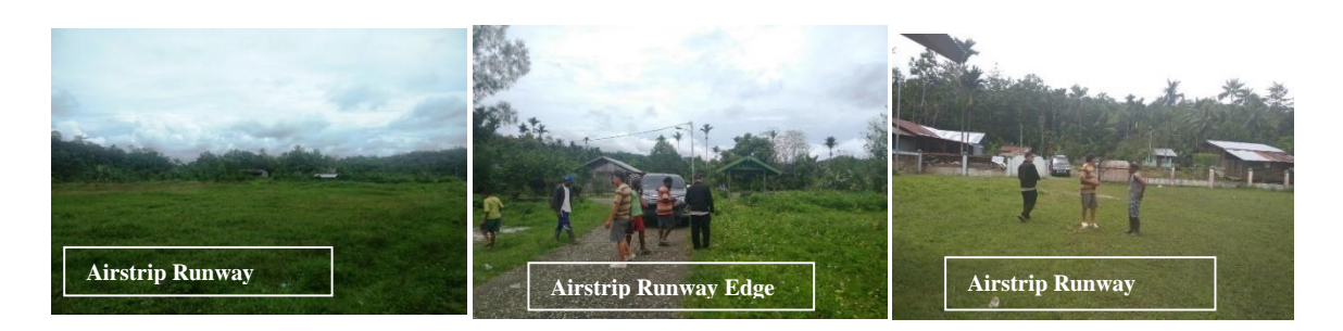
Figure 5. Road Conditions to Airstrip Waris Location