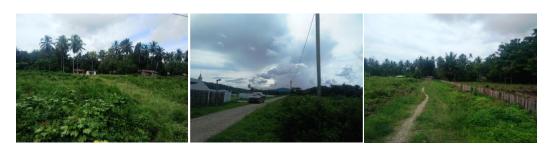
Figure 2. Location of Airstrip Lereh-District Kaureh

Airtstrip Lereh, which is located in Kaureh District, is no longer active. Previously, the Lereh Airstrip was opened by missionary flights with dimensions of 600 meters x 20 meters. The direction of the runway is 12 - 30. At the end of runway 12 - 13 is a bush. The Lereh Airstrip is at an elevation of 29 meters MSL. Airstrip Lereh last operated in 1995 with land ownership over the Church (customary land). Around the location of the Airstrip there are houses of residents.