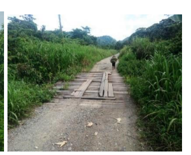
Figure 1. Road Conditions to Airstrip Lereh - Kaureh