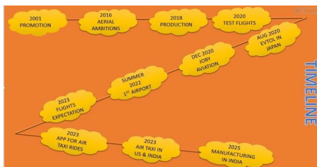
Figure5: Timeline representing evolution in aerial vehicles.

In the summer of 2022, the UK has just launched its first urban airport.