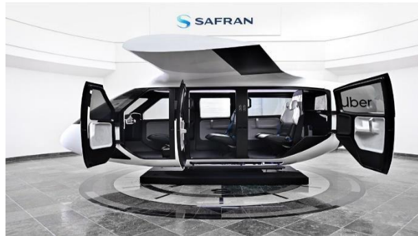
Figure 4: Proposed design of Uber Elevate