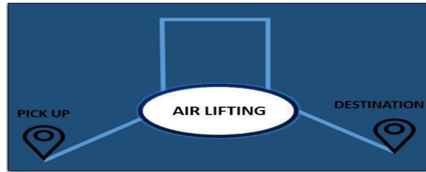
Figure 1: Visual representation for airlifting

Contributing factor in bringing this idea into a reality by developing an air traffic control system for the flying car project. The introduction of aerial vehicles can bring dramatic improvement not just in the automobile industry but also in the lives of the working-class citizens of the country who face various issues every day while driving, riding, or using public transport. Just the idea of making them all-electric can revolutionize traveling in ways unimaginable.