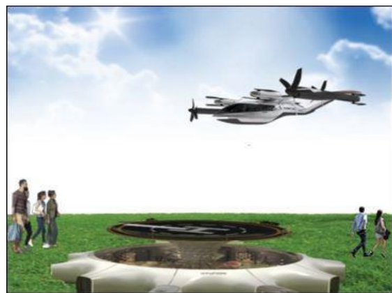
Figure 2: [3][4] Uber Elevate with its vertiport

Uber Elevate project is based on the technology of Urban Air Mobility (UAM)